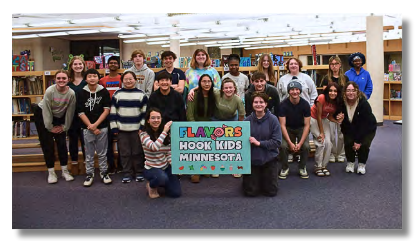
The Student Action Team is made up of 25 passionate students who live and go to school in Ramsey County.

After the trainings, the SAT got to work advocating for change in their communities. ANSR will continue engaging these young people on local policy and prevention work in the coming years.