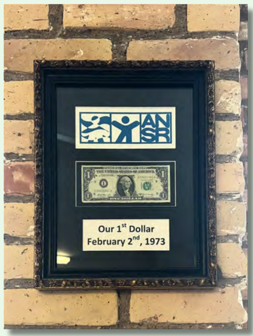
ANSR's first dollar, which hangs prominently in the lunchroom at the ANSR office.

Over the past five decades, ANSR has helped pass groundbreaking commercial tobacco prevention policies at the local and state level. We were there for the 1998 Master Settlement, the 2007 Freedom to Breathe Act, Tobacco 21 in 2020, and, more recently, the 2023 JUUL Settlement. We helped Minneapolis become the first city to restrict flavored products, excluding menthol, in 2015 and the first to restrict menthol in 2017. We have encouraged thousands of multi-unit housing properties to adopt smoke-free policies and have remained a trusted technical assistance provider to others working to reduce the harms of commercial tobacco, alcohol and other drugs.