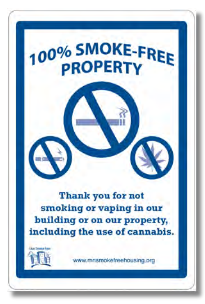
Updated LSF signage that includes cannabis.

In addition to direct assistance to properties, LSF provided technical assistance to SHIP grantees working on smoke-free housing strategies throughout the Twin Cities metro area. As part of this technical assistance, LSF hosted virtual, bi-monthly "Smoke-Free Housing Sharing Meetings" for grantees statewide working on smoke-free housing efforts. LSF also began updating materials, including signage and educational resources, to help Minnesota housing providers and residents understand and adapt to cannabis legalization in Minnesota. Secondhand cannabis smoke in multi-unit housing is a significant concern for housing providers and residents, and LSF is maximizing limited resources to help protect Minnesotans from this growing threat to clean air.