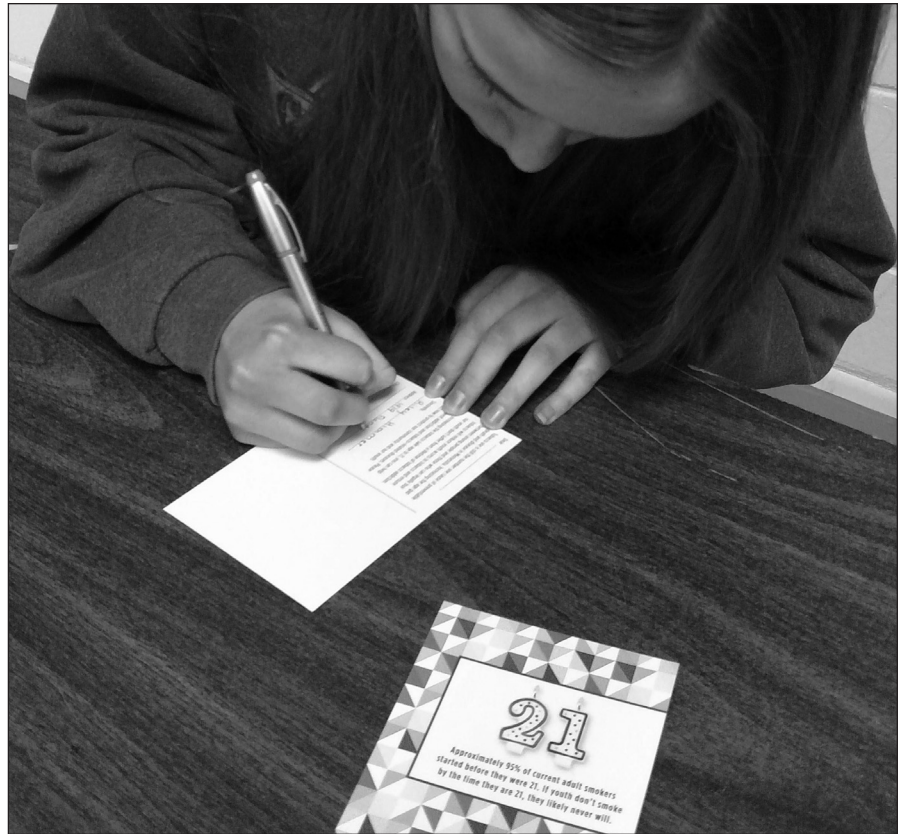
ANSR staff photo

The policy was the result of the work of the Tobacco-Free Minneapolis Parks coalition, led by NorthPoint Health & Wellness and ANSR. The coalition will hold a celebration event this summer and will lead policy promotion and cessation activities with parks staff. Stay tuned for more details. In the meantime, visit your favorite Minneapolis park and keep an eye out for their great-looking signs!