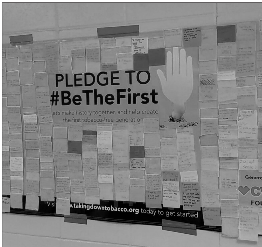
ANSR staff photos

Several ANSR partners got out the message to quit smoking on Kick Butts Day on March 21. Clockwise from the top left, staff at Maplewood City Hall chalked up the sidewalks with reminders; John Glenn Middle School youth signed a pledge wall to be tobacco free and the Support Our School Group gathered postcards aimed at decision makers to raise the tobacco sales age to 21; and then Mounds View youth also educated their peers about the tobacco industry's targeting tactics and also gathered postcards.