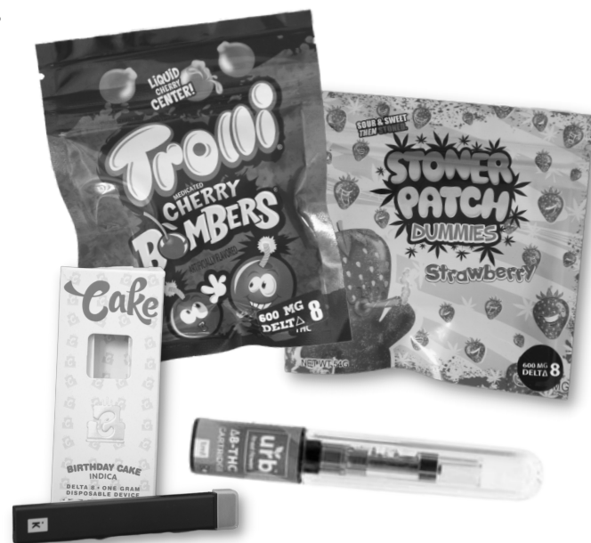
Delta 8 products (bottom to top): Cake Delta8 Disposable Vape, URB Finest Flowers delta-8 product Vape Cartridge 1 ml; Trolly Medicated Cherry Bombers, and Stoner Patch Dummies

There is no clear statement from any branch of the federal government to say how delta-8 products are regulated.