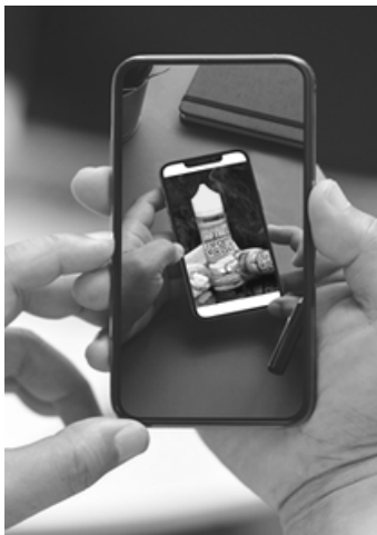
Preventing online sales of vape products is an important policy priority.

To document how easy it is to obtain e-cigarettes on the internet, we purchased