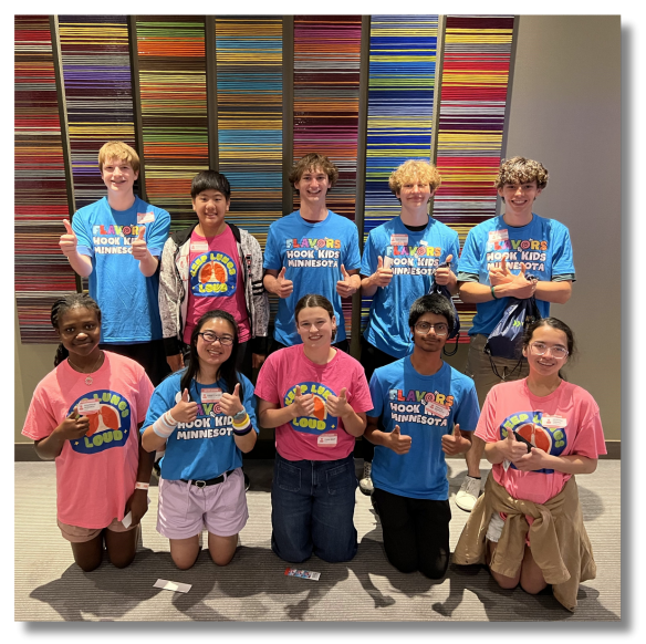
Ramsey County Student Action Team members at the 2024 EPIC Youth Gathering in June.

The group has its first official meeting in mid-September. Staff are eager to engage students in local policy work, statewide advocacy, peer-to-peer education, and outreach opportunities this school year. These young leaders will make their voices heard and make change!