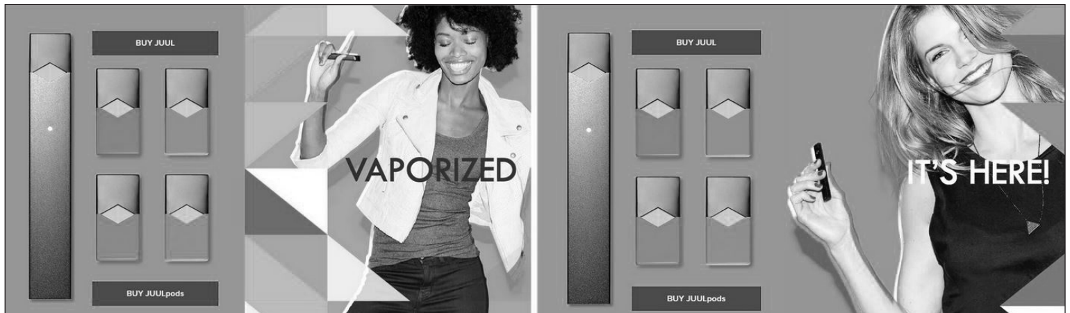
An example of JUUL's early marketing. The bright colors and young models likely make the ad appealing to youth.