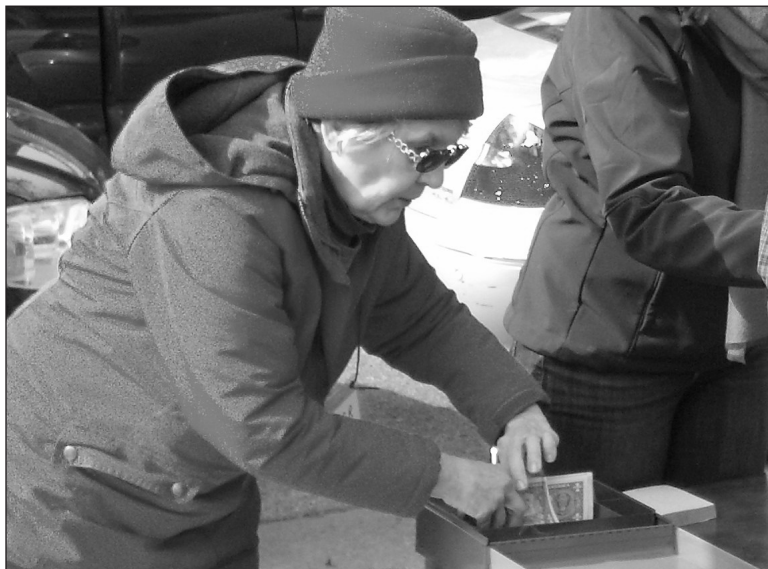
ANSR staff photo