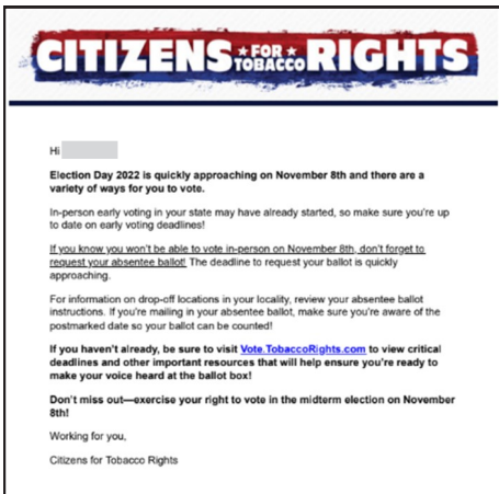
Above: Citizens for Tobacco Rights sent emails encouraging leading subscribers to vote in the 2022 Elections. They shared information on how you can vote and the importance of voting. (Email received Oct. 10, 2022)

Project Watch has identified several examples of the tobacco industry's performative social justice in past issues. Most recently, Marlboro is donating to Hurricane Ian relief. Marlboro's concern should also extend to tobacco's global footprint and the toll it takes on climate change .