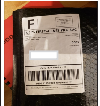
Above: The left image depicts an e-cigarette order confirmation in February 2022 with the USPS tracking number provided from the retailer, Loon MN. The right image is a photograph of the package that was shipped and delivered by USPS, left on the front door, with no age verification conducted for delivery.