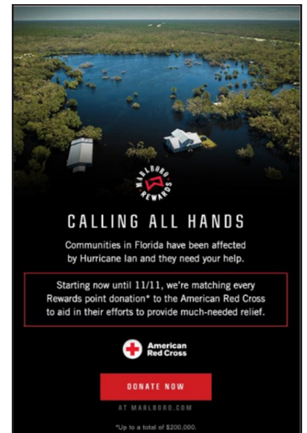
Right: Marlboro matched rewards point donations to the American Red Cross through 11/11/22 to help support communities affected by Hurricane Ian. (Email received Oct. 28, 2022)

Project Watch has identified several examples of the tobacco industry's performative social justice in past issues. Most recently, Marlboro is donating to Hurricane Ian relief. Marlboro's concern should also extend to tobacco's global footprint and the toll it takes on climate change .