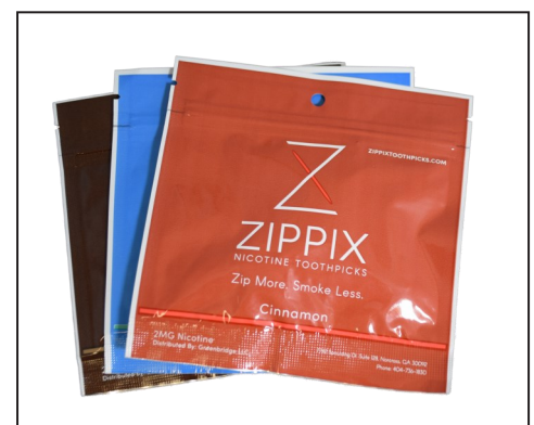
Example of a nicotine toothpick from from the brand Zippix.

Nicotine toothpicks seem to be a recent and bizarre product released by the tobacco industry. In 2020, the FDA had issued a warning letter to Smart Toothpicks , another brand of nicotine infused toothpicks, for violating the 2009 Family Smoking Prevention and Tobacco Control Act for not adequately labeling their products with a nicotine warning statement and selling their products to persons under 18. Brands like Zippix , Pixotine , and Nicotine Picks are selling toothpicks infused with nicotine. These toothpicks are available in a variety of flavors including mint and menthol, cinnamon, butterscotch, mocha. The cost of these products range depending on the quantity. Many of the smaller packs cost approximately $6-$8, whereas larger bundles of 120 can cost approximately $36-$60.