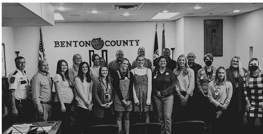
Benton County Commissioners with public health staff, community members, and ANSR staff after the public hearing and unanimous vote in support of the tobacco licensing ordinance.

ANSR GEARS UP TO WORK ON FLAVORED TOBACCO PRODUCTS AT THE STATE LEGISLATURE