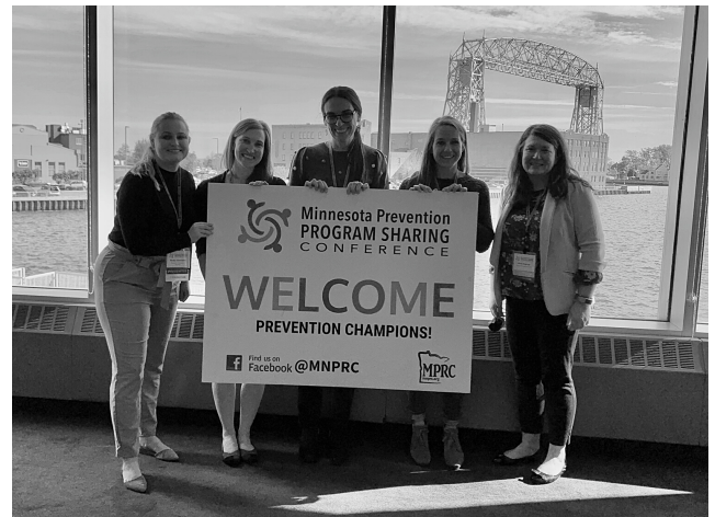
ANSR staff attending and presenting at the Minnesota Prevention Program Sharing Conference.

Save the date for next year's conference which will be held October 17th and 18th, 2023 in Brainerd!