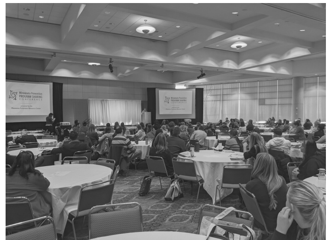
Attendees listen to the keynote presentation during the conference in the Duluth Entertainment Convention Center.