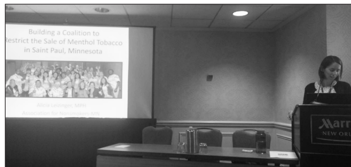
ANSR staff photo

This summer, staff and residents of public housing agencies (PHAs) across the state are celebrating the implementation of new smoke-free housing policies. In accordance with a new rule from the U.S. Department of Housing and Urban Development, all public housing nationwide must be smoke free by July 31, 2018. The Live Smoke Free Program provides statewide assistance to Minnesota PHAs and, along with partners, recently helped kick off new policies at several metro area agencies including the Dakota County Community Development Agency, the South St. Paul Housing and Redevelopment Authority, and the Saint Louis Park Housing and Redevelopment Authority. The smoke-free policies at these agencies created 2,493 affordable, newly smoke-free units for low-income Minnesotans.