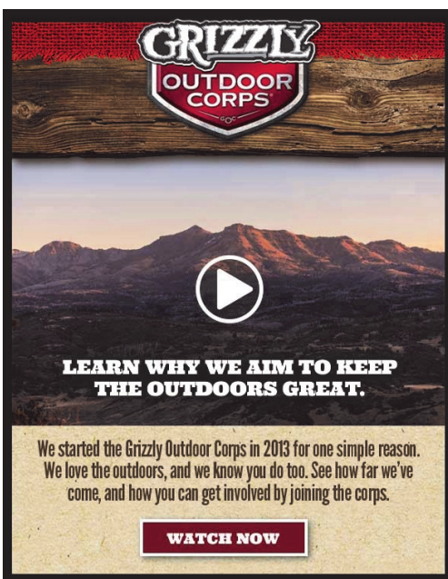
Grizzly promotes their initiative as simplistic and masculine.