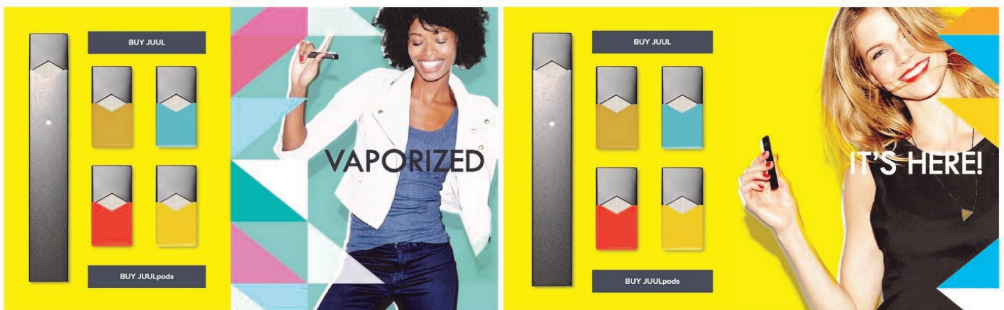
An example of JUUL's early marketing. The bright colors and young models make the ad appealing to youth.