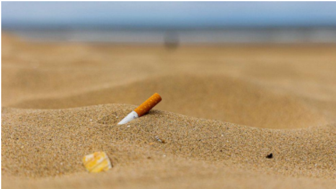
In this undated stock photo, a cigarette butt is shown in the sand on a beach.

Electronic cigarettes are no less friendly to the earth, the report says.