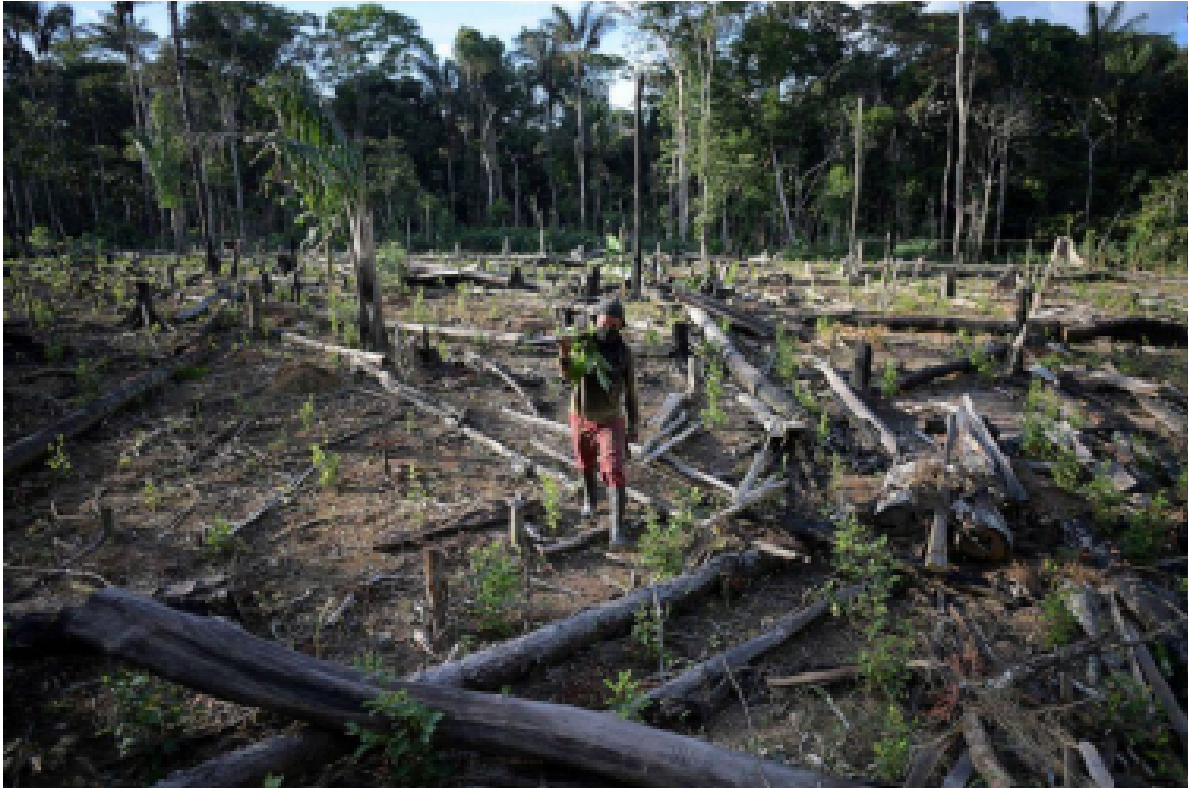
In this Dec. 6, 2021, file photo, a farmer carries a chainsaw at a coca plantation after cutting down trees to plant coca in Guaviare department, Colombia.

on health to smokers, non-smokers and farmers. And not only is tobacco harming humans, it is also damaging the environment.”